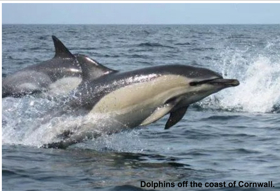
Dolphins off the coast of Cornwall.