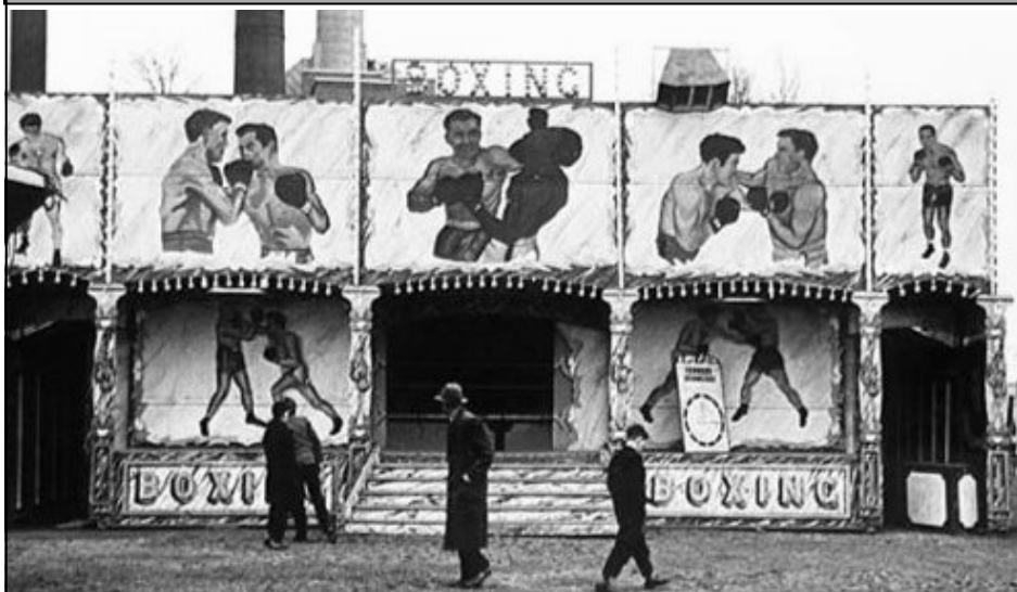
Boxing Booths were amongst the many events at Parish Feast Days, (see History Snippet)