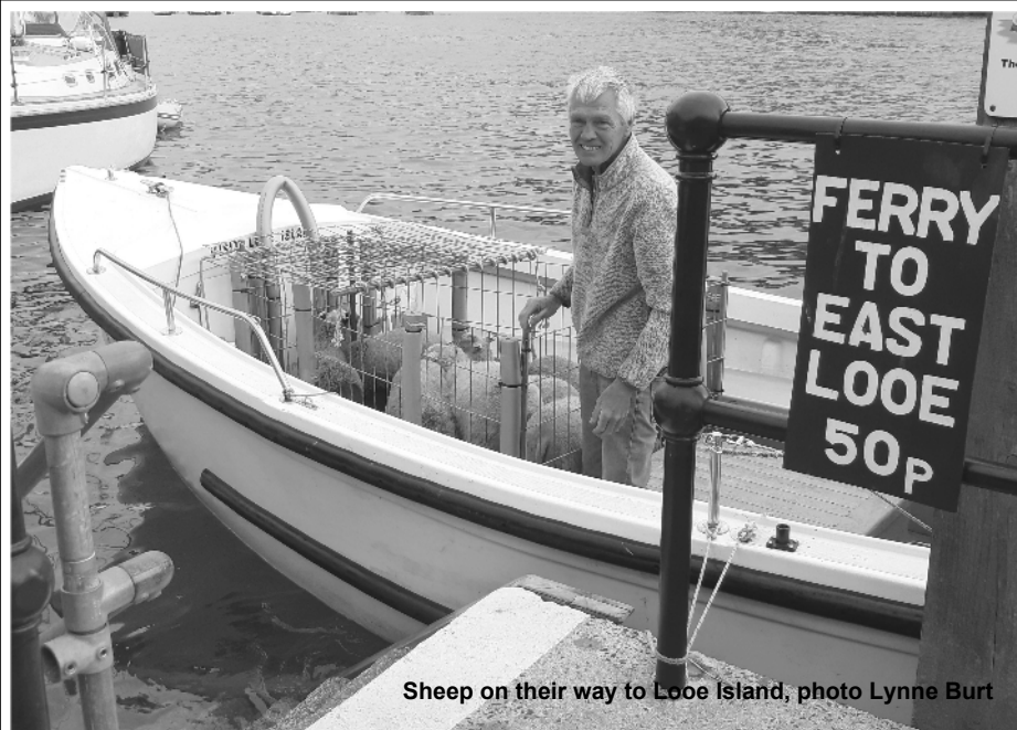
Sheep on their way to Looe Island