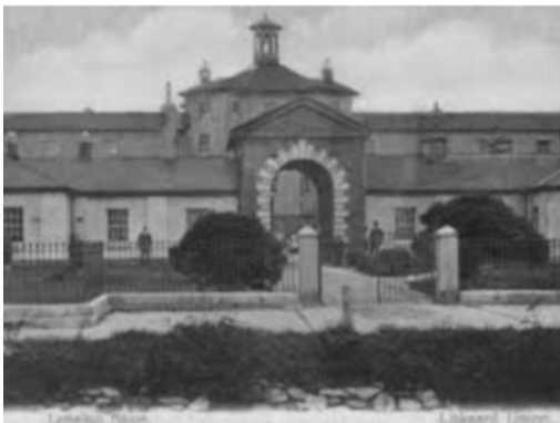
Liskeard Union Workhouse