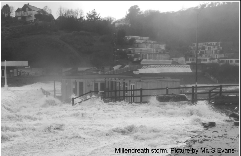
Millendreath storm.