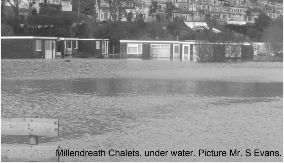
Millendreath Chalets, under water.