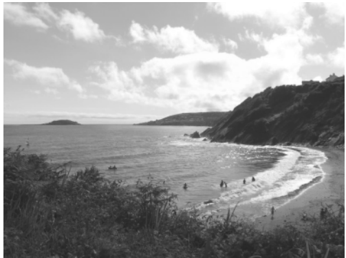
Millendreath Beach part of the South West Coast Path.

Meeting with a birthday party at Land’s End on 7th May 2013, the South coast series starts at Poole on 3rd April, with the North coast series starting at Minehead on 16th April. Each leg will be guided by local experts, rangers and path wardens, who are all assisting the SWCPA with this event.