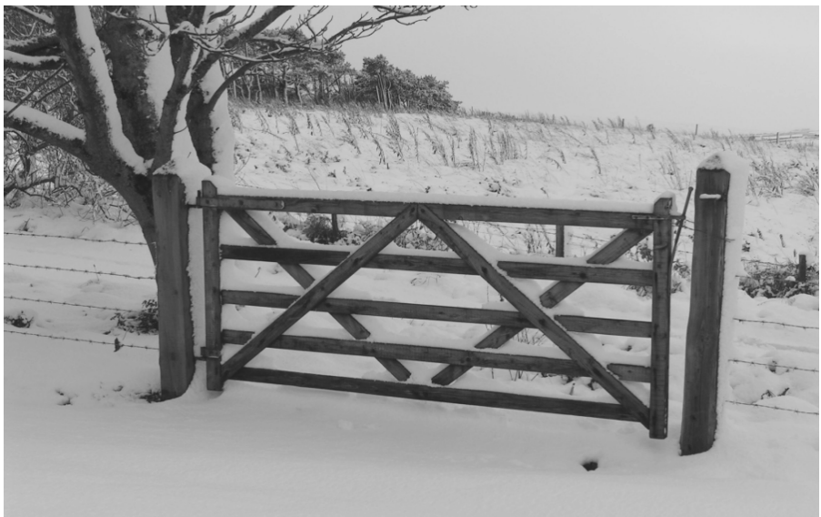
St Martins in winter