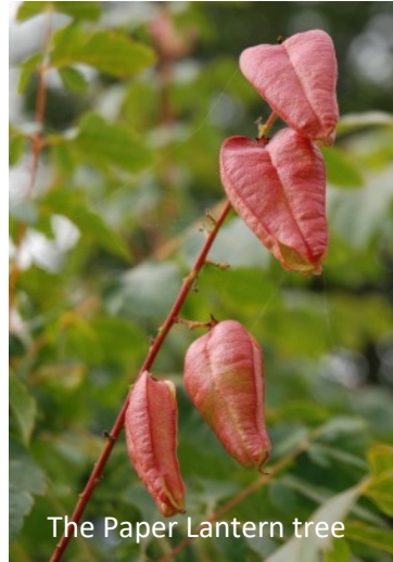
The Paper Lantern tree

Some visitors to the garden in these dry conditions are a number of slow worms, most of which have been found in the compost heap - they are obviously breeding there, or close by, due to their varying sizes. They are a very handsome member of the reptile family, one that I have been familiar with since my childhood.